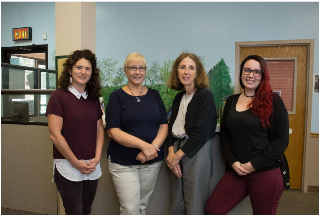
The staff at Norwood Adult Day Health Center are ready to welcome new participants.